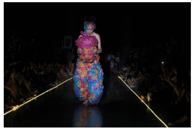
Performance Image by Jean-Luc Vilmouth

Tickets and Inquiries: Echigo Tsumari Art Field Information Center